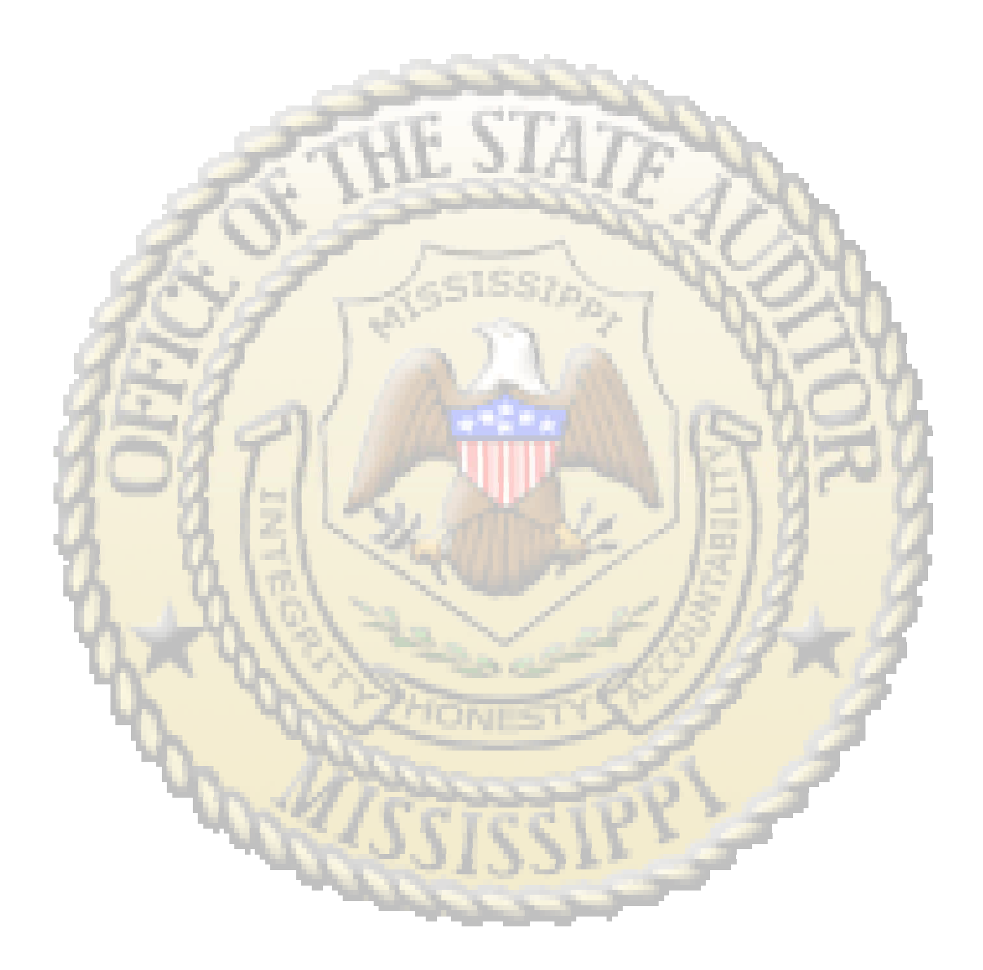
The Office of the State Auditor does not discriminate on the basis of race, religion, national origin, sex, age or disability